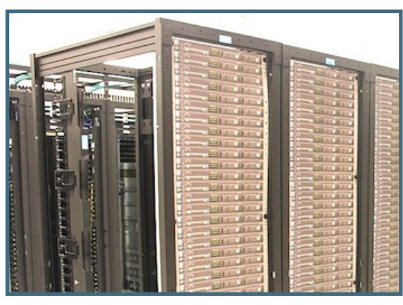
Simple Push Rivet Install