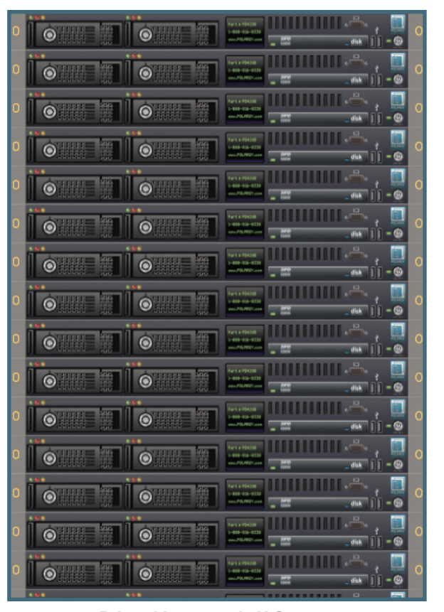
Printed Images of 1U Servers