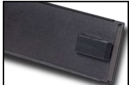
Single Slide Latch on Other End