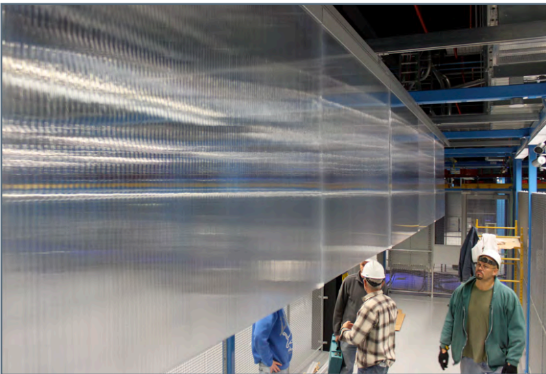
Installation of SPS

Client desired “removable” rigid vertical partitions because of a need for easy and quick removal for access and cleaning. Client also required aesthetically attractive and visually interesting permanent partitions for selected non-tenant areas.