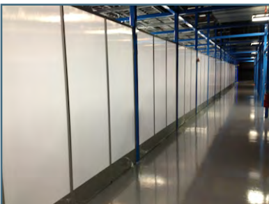
“Light Box” Containment