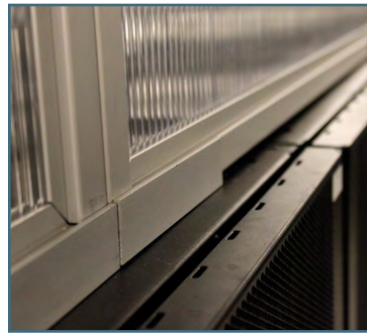
Panel and F-Bracket