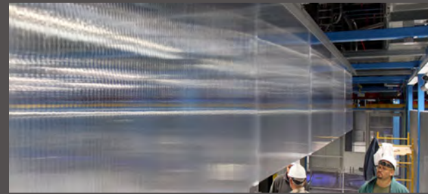
Ceiling Supported Hot Aisle Containment

Server Racks & Airflow Accessories PolarRack™ XG server racks are frugal with kilowatts and let cool air flow freely to server intakes but prevent air bypass inside the cabinet. Designed with square corners and a flat top, adding containment is quick and easy. PolarDam™ fire-safe air dam foam meets UL-94-HF-1 rating and is the best kept secret for sealing cable cutouts and other raised floor openings to prevent cold air bypass. It is self-forming foam that seals any opening, blocking cold air from escaping and mixing with hot air. It fills large and small air gaps quickly and easily without tools for a fraction of the cost of brush grommets. PolarFlex™ 42U blanking panels seal empty racks and large unoccupied spaces in server cabinets and are an easy and cost-effective alternative to hundreds of individual blanking panels. PolarFlex panels are made of fire-rated Lexan film printed with server images to give the appearance of a full racks, and are easily cut with scissors when a partial panel is all you need. PolarBlock™ air dam skirts and barriers prevent bypass air below, above and between racks and other equipment.