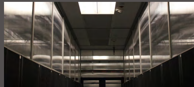
Cabinet Supported Hot Aisle Containment