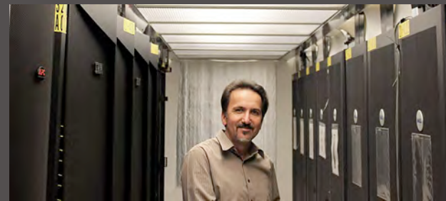
Cabinet Supported Cold Aisle Containment