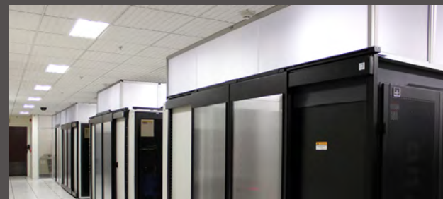
Floor Mounted Hot Aisle Containment