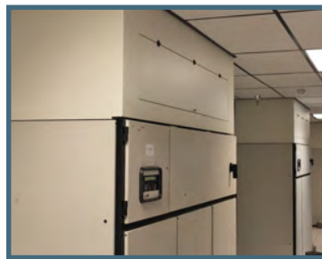
CRAC Extensions to Increase Delta-T