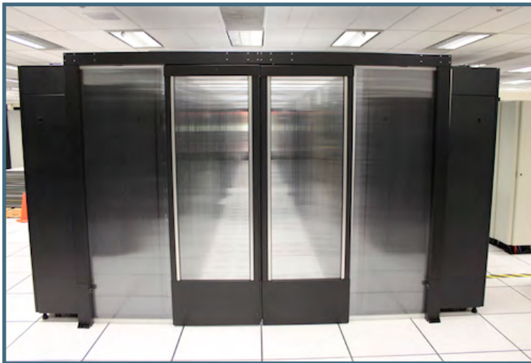
Cold Aisle Containment

Verizon executives set aggressive energy conservation goals for the corporation. Reaching those goals necessitated measures that achieved significant and rapid savings. Airflow controls proved to be a low cost, easy-to-deploy energy conservation measure that assured Verizon could meet its energy reduction goals. Polargy was selected to manage a rapid deployment of Cold Aisle Containment across twelve of Verizon's major data centers. Polargy successfully completed the project on schedule with impressive results.