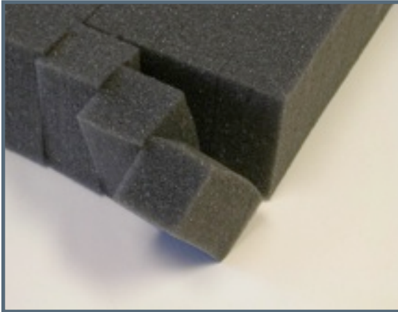
Easily Makes Any Size or Shape